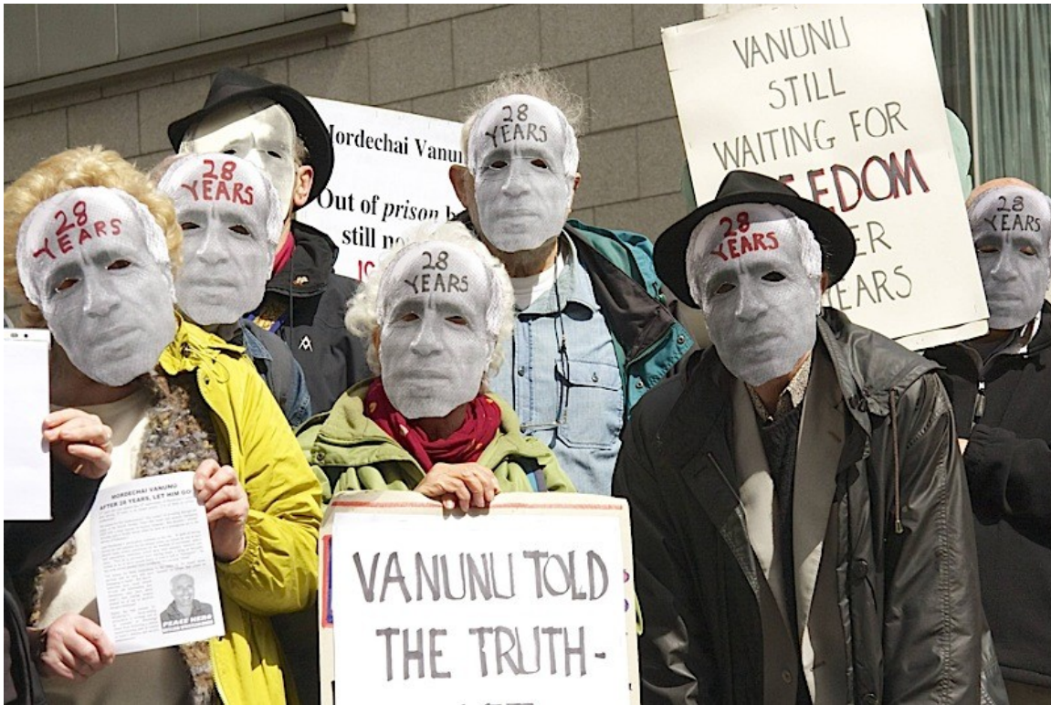
UK supporters

In the old days, while Vanunu was behind bars, hundreds of Free Vanunu Vigils were held and thousands of calls for nuclear abolition were delivered in front of Israeli embassies, consulates and other public sites in Wellington, Sydney, Jerusalem, New Delhi, Chennai, Hiroshima, Washington, D.C., San Francisco, Boston, Toronto, Vancouver, London, Salisbury, Leicester, Lisbon, Rome, Stockholm, and Oslo.